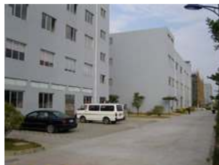
The Factory building is only 18months old and includes modern living quarters for all staff as well as ample room for expansion.

BrandStand NZ MD Stuart McNeil recently visited the production facility in China to see the latest product developments and innovations to assess their relevance to the Australasian market.